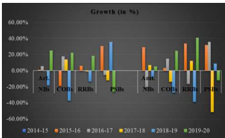
Chart 3: Growth in Loan Amount and Loan Account Sanctioned to Weaker Section (WS) by Selected Bank Group of Gujarat State

2019-20 respectively. With reference to credit provided to SHG by RRBs (Regional Rural Banks), the negative growth has been registered at 16% and 380% in 2016-17 and 2018-19 respectively. Vice versa, the positive growth rate of 9%, 311% and 65% has been seen in 2015-16, 2017-18 and 2019-20 respectively. In the context of advance of SHG disbursed by PSBs (Private Sector Banks), the positive growth has been recorded at 43%, 5% and 58% in 2016-17, 2017-18 and 2018-19 respectively. Vice versa, the negative growth rate of 60% and 72% has been seen in the year of 2015-16 and 2019-20 respectively.