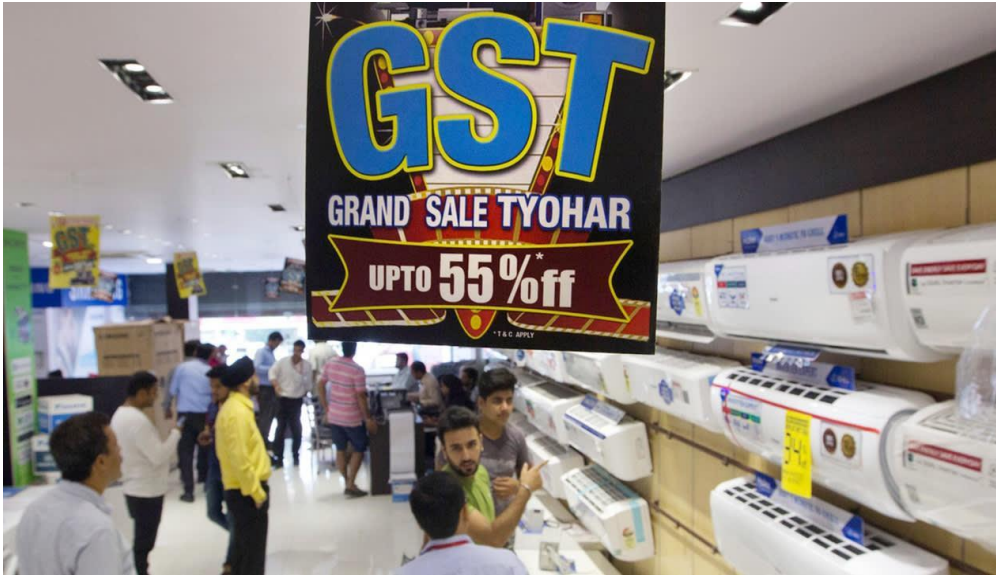
Fig 7: A shop with consumer durables

The tax rates on movie tickets and five star restaurants has increased around 5-6 percent and on air tickets economy class has a little decrease