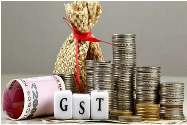
Fig 1: Impact of GST on money