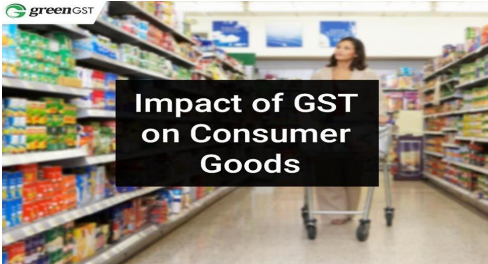
Fig 3: Goods in a store