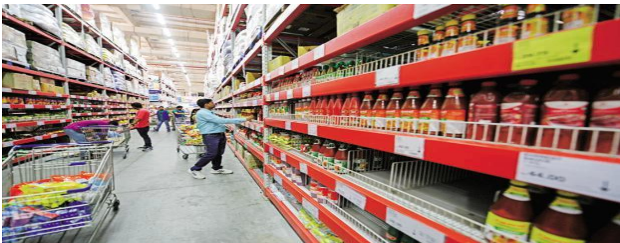
Fig 6: Departmental store with dearer goods

The tax rates on all the daily need items were come down after implementation of GST compare to VAT rates.