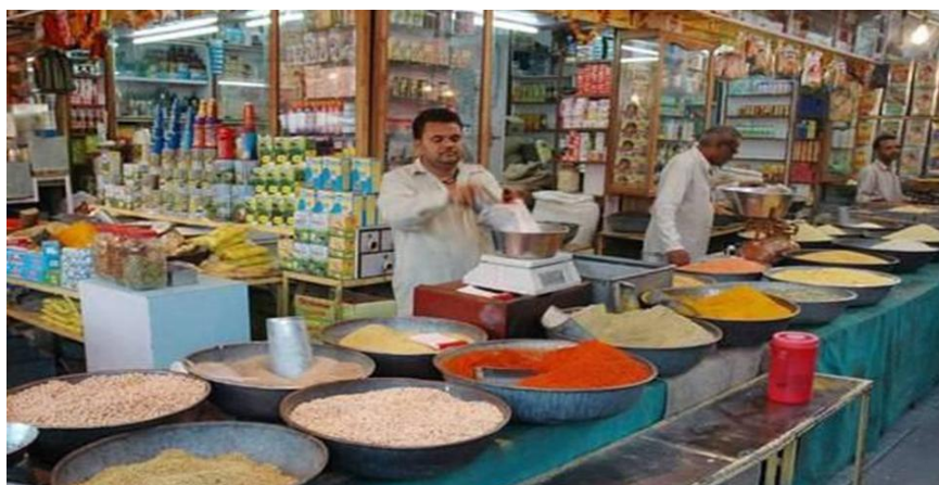
Fig 5: A retail shop with daily needed goods

The new GST regime brought with it a slew of overarching impacts on a multitude of commercial sectors. The consolidation of various levies into a singular structure has affected almost every aspect of consumption in our lives. Hence, we are doing a series of blogs about the impact of GST rates on consumers.